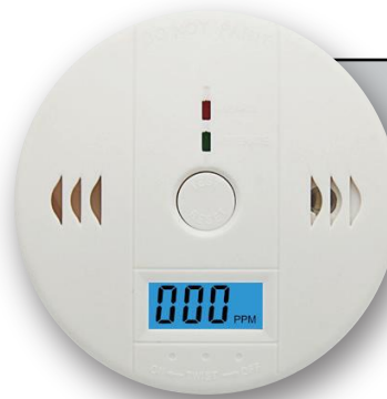
JKD-602 Battery Operated