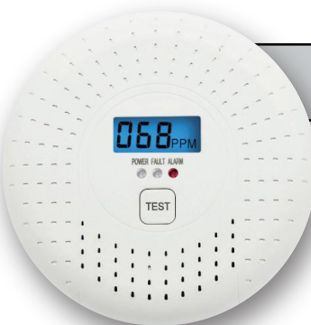
JKD-609 Battery Operated