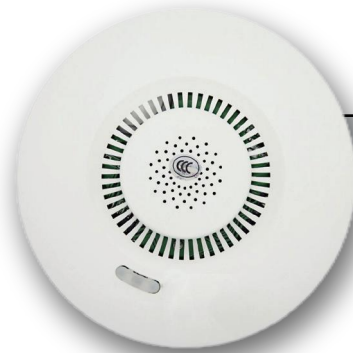
JKD-511 Lithium battery operated