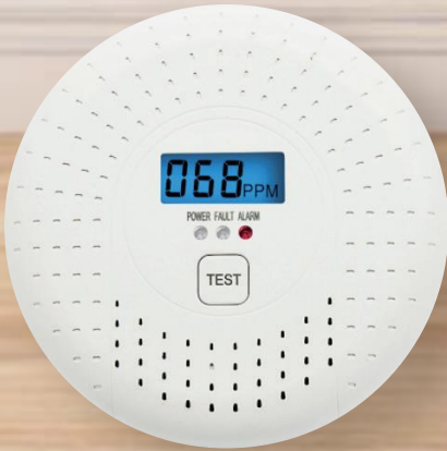
JKD-609 battery operated