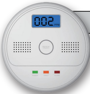
JKD-601 Battery Operated