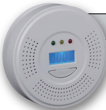
JKD-610 Battery Operated