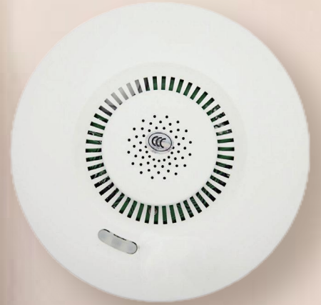
JKD-511 Lithium battery operated