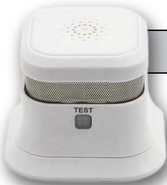
JKD-502 Lithium battery operated